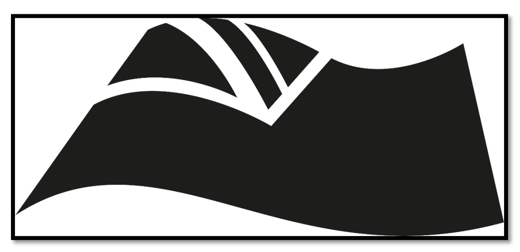
1121/Year of affixing mark (i.e. 2023 or 23)

The UK Conformity Mark must be affixed to marine equipment in accordance with the Regulations and must take the form set out above as detailed within Annex 5 of MSN 1874 (M+F) (as amended). (Mandatory Information).